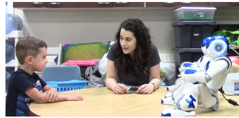
Fig 1. We explore children's reactions to robot errors, which can be quite different from errors people make (image used with parental consent). beings [7]. In this paper, we provide a discussion and initial framework for focusing on robot-typical errors in Human-Robot Interaction (HRI), especially within Child-Robot Interaction.